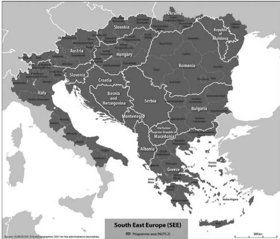
Figure 2. SEE transnational cooperation in the framework of Interreg IVB.

undoubtedly help to ease tension and confrontation with Moscow and shape Russian Federation–EU relations in the twenty-first century. The fact that all the EU members adopted the mandate for talks in May 2008 illustrates the – often missing – unity of the EU. As Mikhail Gorbachev notes: the time seems ripe for a ‘comprehensive dialogue aimed at constructing an advanced partnership between the European Union and Russia’ (Gorbachev 2008, 4). In a sense, the tensions as a result of the Georgia crisis in August 2008 merely highlight the importance of this.